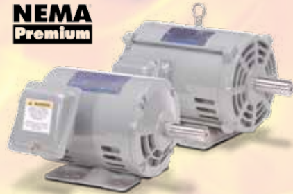
ODP Rolled Steel High Efficiency (Front) ODP Rolled Steel NEMA Premium Efficiency (Back)