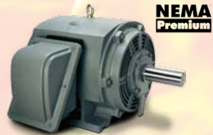
ODP Cast Iron NEMA Premium Efficiency